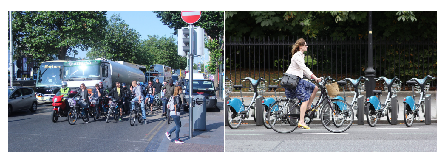
Cyclist.ie , the Irish Cycling Advocacy Network, is the umbrella organisation for cycling advocacy groups in Ireland and is the Irish member of ECF, the European Cyclists' Federation.