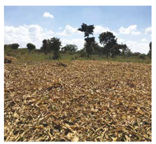
Farm in Mtchinji, Malwai, 2016.

This field in Malawi may look like crops have failed, but in fact the opposite! The use of old maize leaves on top of soil is a process called 'mulching', which helps keep the moisture in the land.