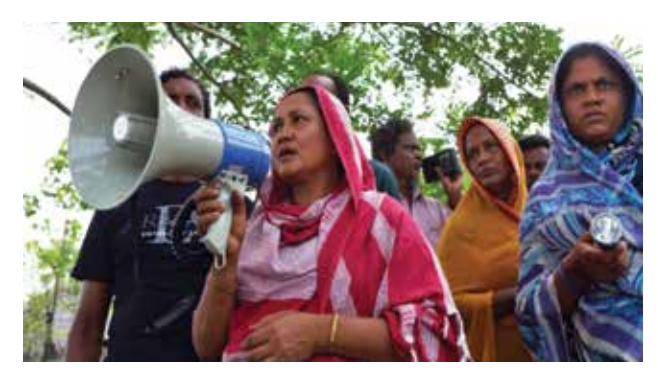
The Paribartan project has set up task forces for early warning within coastal communities Before a disaster occurs, these early warning task forces are able to warn villages so they can implement their preparedness activities and, if necessary, evacuate to safety. N/A.Gabura, Shyamnagar, Satkhira Bangladesh October 2015

Production of plastics alone are responsible for CO2 emissions which is a huge contributor to climate change. 1kg of plastic bags produces around 6KG of CO2.